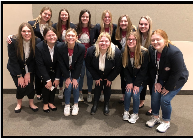
The entire HOSA Team