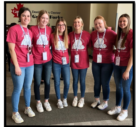
Winning t-shirt design